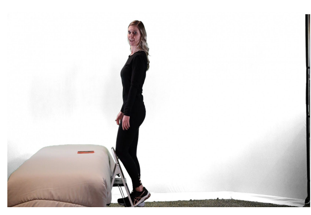
Complete 3 sets of 10 reps on each side.